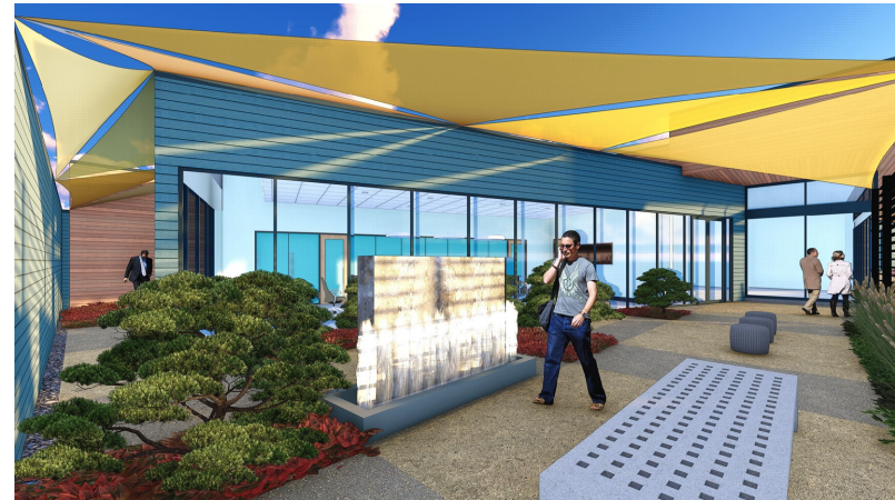
Healing Garden $300,000

960 sq ft room will be used for our Addiction Information Series for adolescents and their families and recovery support education for clients. Community workshops and professional training sessions will be held in this room.