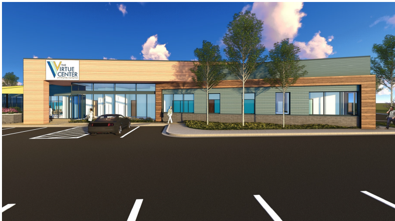
The Virtue Center Building $1,000,000

A unique installation located in the entry of the building will honor all donors of $5,000 or more. Recognition signage will vary in size based on the following giving levels: $5,000, $10,000, $25,000, $50,000, $100,000, $250,000, $500,000 and $1,000,000.